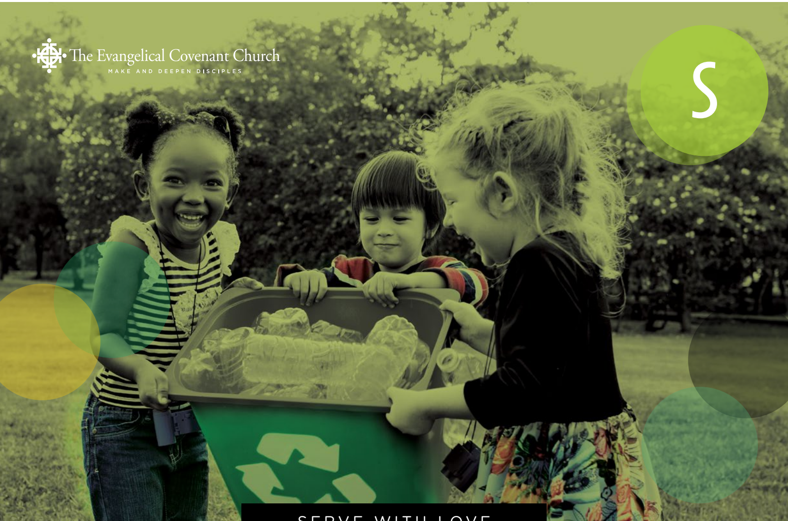
SERVE WITH LOVE

Has someone ever done something really special for you? What did they do? Have you ever seen someone do something special for another person? Jesus served others with love all the time.