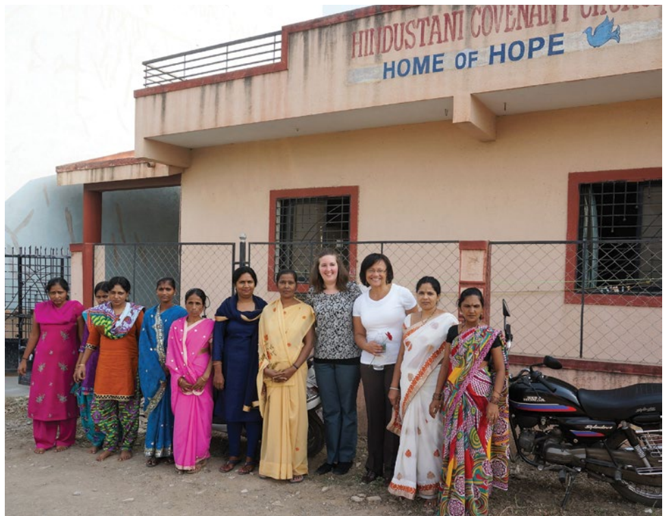
Women leaving the commercial sex industry find rest, vocational training, and counseling at the Home of Hope in India.

staff worker who is seeking to help women and girls begin a new life through counseling and training at the Home of Hope. Some of these women, who are living at the Home of Hope, have left their work in the red light district and are now making communion