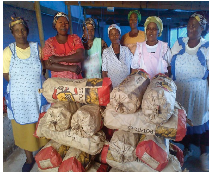
Women join together for support, to save, and run a small business in South Africa.

been given to the members and all loans have been repaid. The self-help group has thrived because of their commitment and the community they've built. They have started a small business of buying and selling common household items. This business has helped them to more than double their savings.