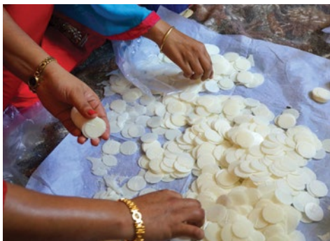
To order communion wafers from the Home of Hope, contact our office.