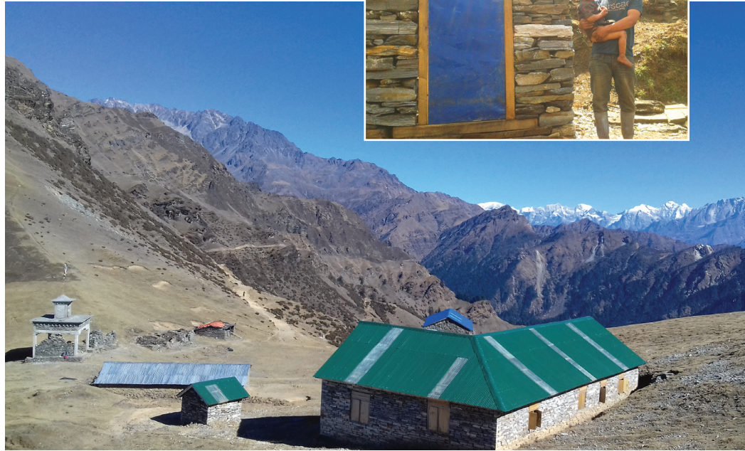
In remote Nepal, CWR is providing access to clean water and sanitation for children and families.

In their report Shanti Nepal wrote, "During this difficult phase after the destruction of the earthquake, people have understood the importance of hygiene and sanitation so they are building toilets mostly with their own contributions. Shanti Nepal has provided materials, monitored the construction, and provided technical support and supervision. Residents of Tipling