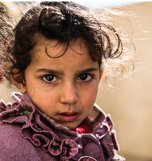
Your gifts to CWR are providing life-saving relief in Aleppo.

We have been working in Aleppo, Syria, for several months through a local partner to provide relief in the midst of heartbreaking conditions.