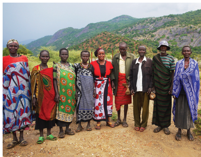
Communities that have long been in conflict are finding peace through a local CWR partner in Kenya.

of developing understanding and caring for one another's families. They care for each other through visits and sharing gifts that assist in meeting their basic needs. These regular visits have helped the women to develop friendships that are strengthening communal trust and relationship with the once opposing community. Where there once was distrust, jealousy, and anger, there is now reliance, trust, and friendship. This is an example of CWR's peacemaking work in the world.